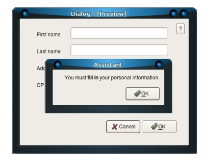
Figure 1. A help message leads the user through the UI.

At the end we hope to develop a method to automatically generate dynamic help systems that are aware of the context of use, the current task the user is performing, the structure